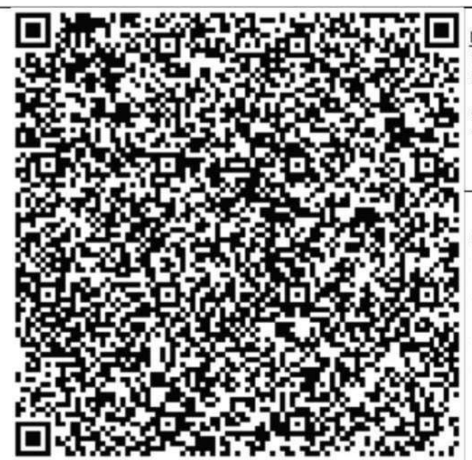
SANCTION QR CODE